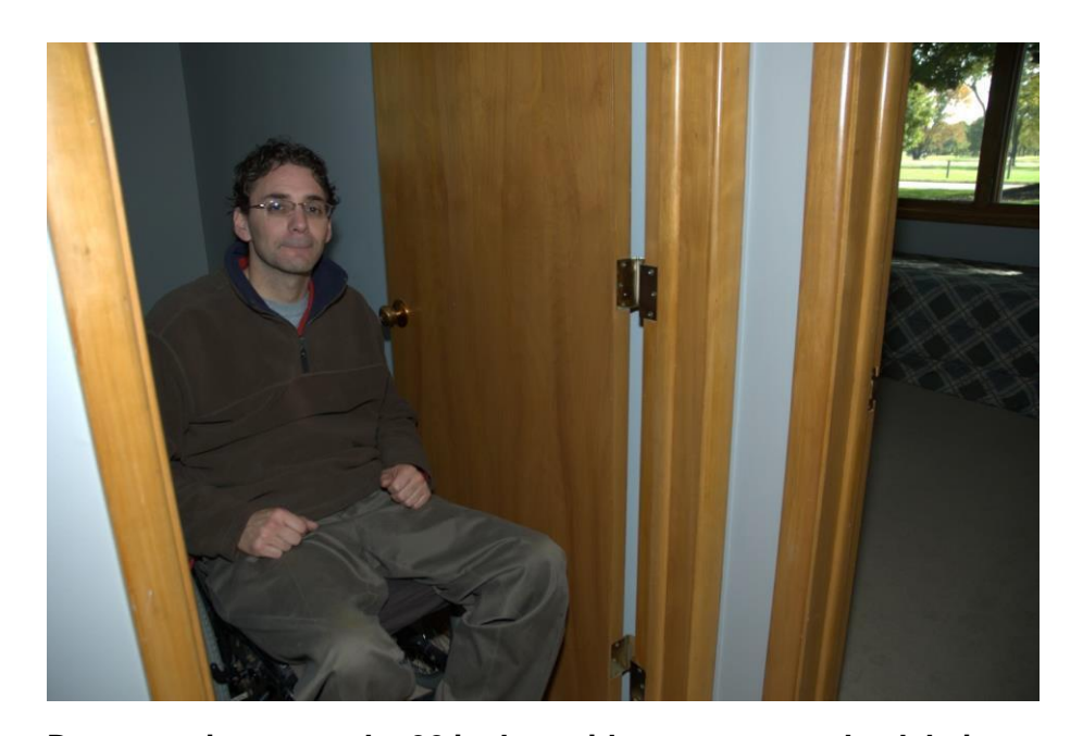
Door openings must be 32 inches wide to ensure a wheelchair can pass through.