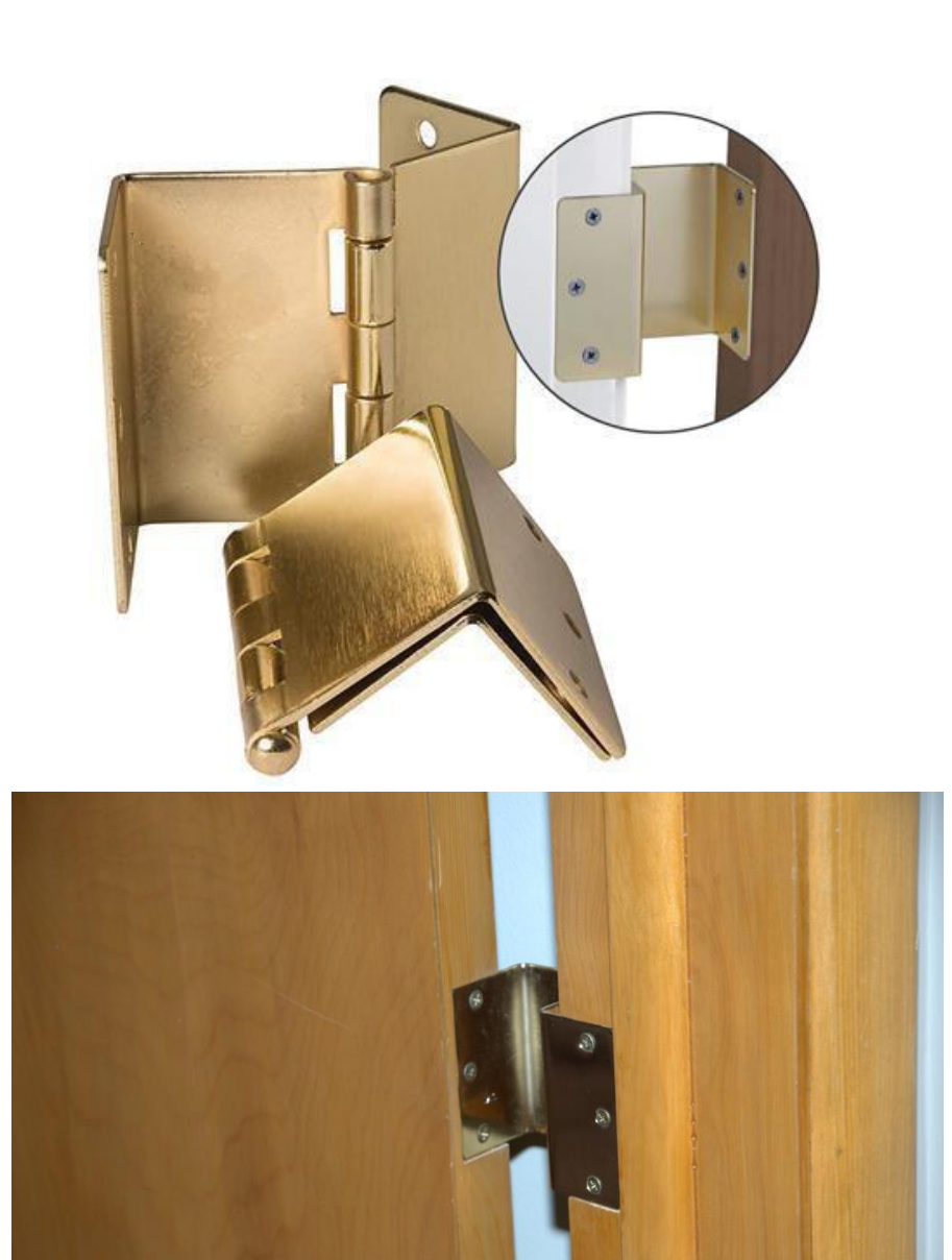
Adjust door hinges to create width.